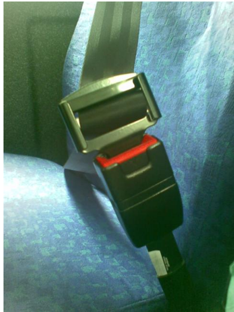
Figure 2: Harness without cover fitted