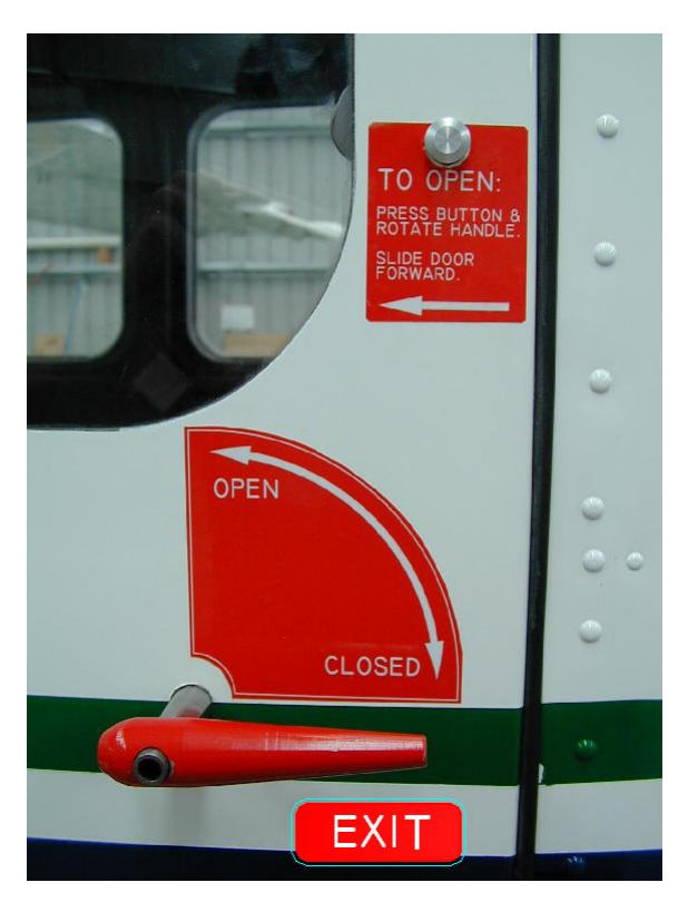
Figure 2 - External Placard on Rear Door