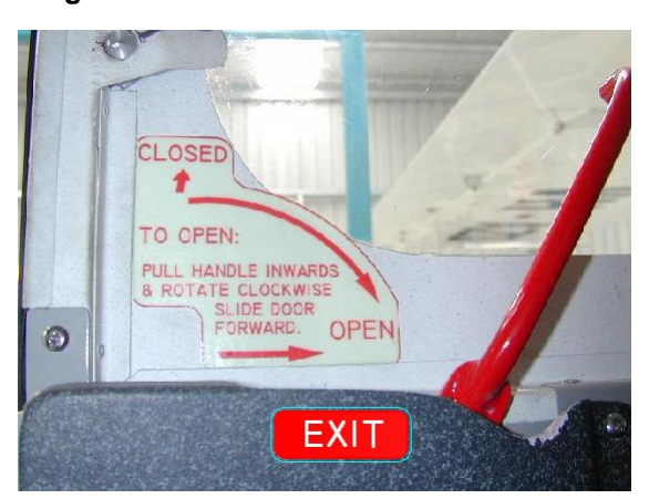
Figure 3 – Internal Placard on Rear Door