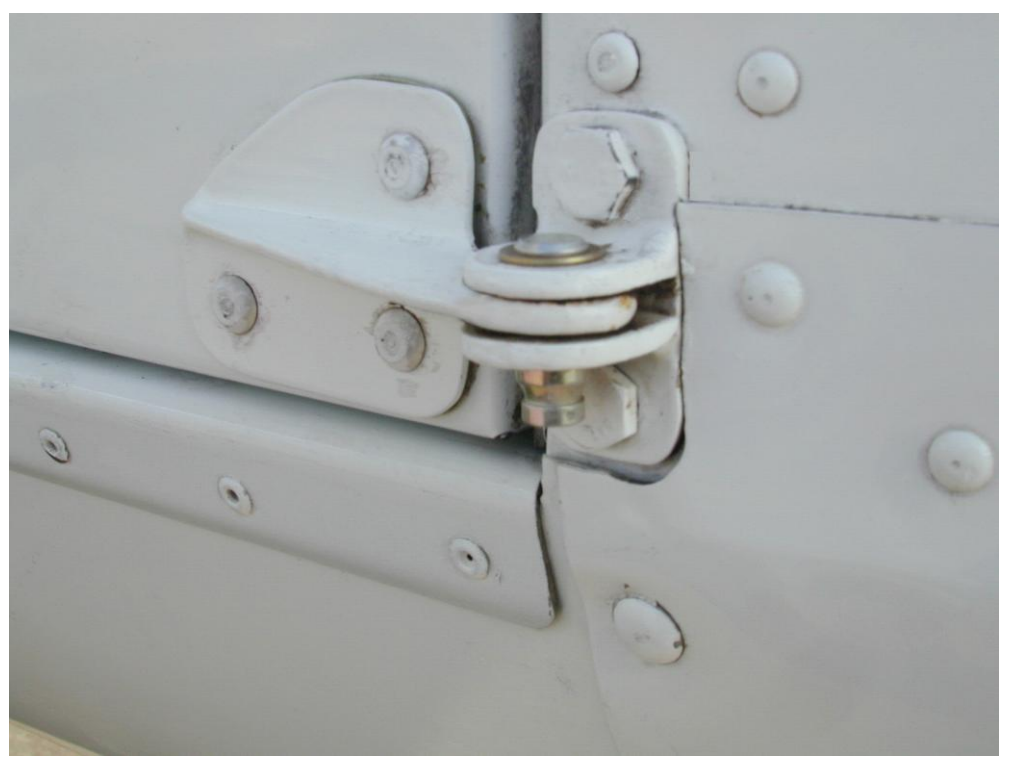
Figure 3: Tamper Proof Forward Door Hinge Pins <u>NOTE:</u>

Any padlock that allows minimal movement of the rear door lock may be used with this door locking system; for Australian registered aircraft compliance with DOTARS requirements requires that any padlock used complies with Australian Standard AS 4145.2-2002 Locksets – Padlocks.