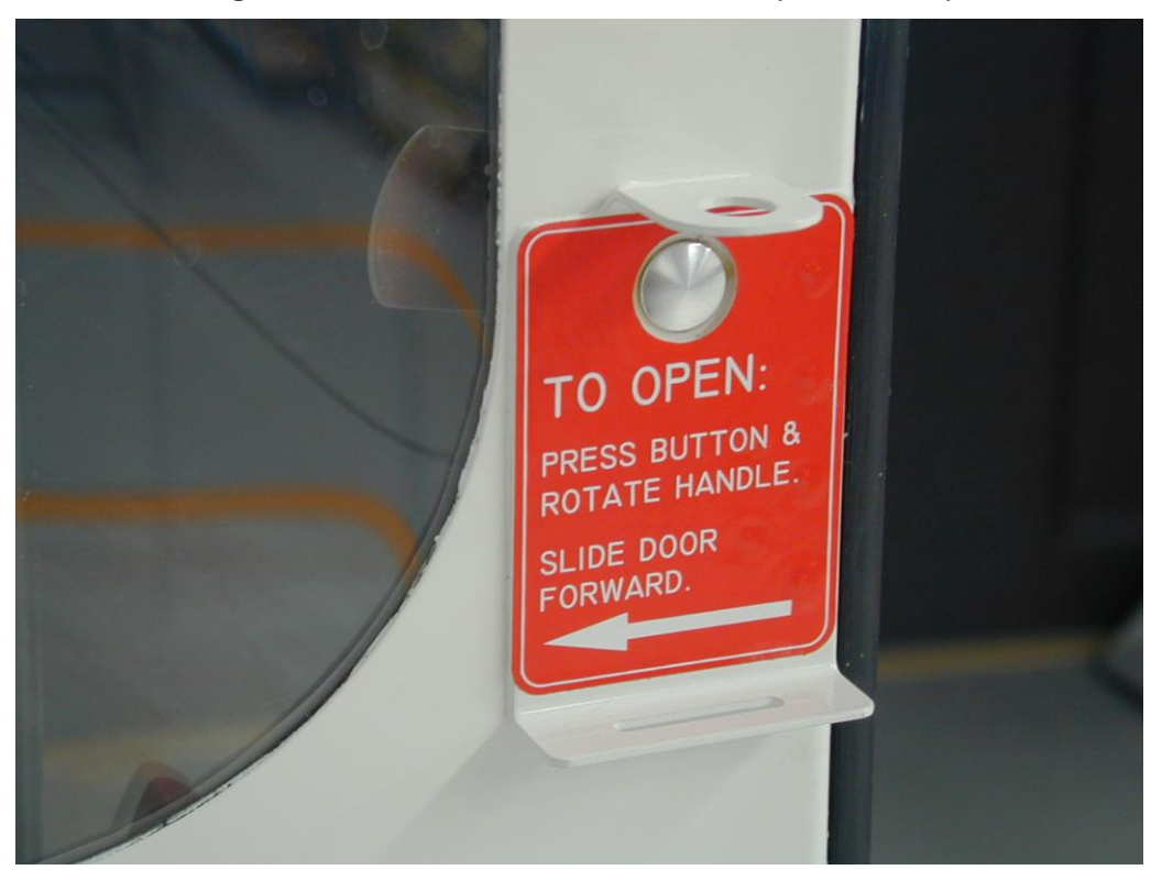
Figure 2: Installed Cabin Door Lock Bracket