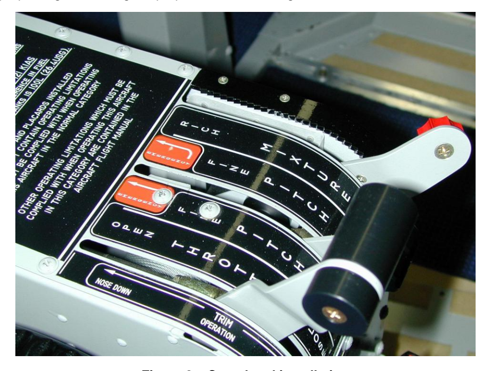
Figure 2 – Completed installation