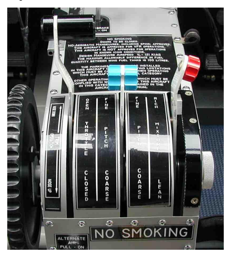
Figure 2 - Throttle quadrant placards